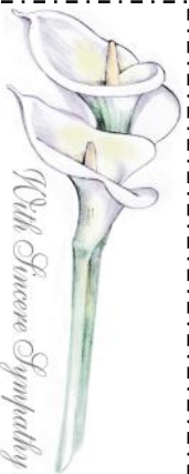
With Sincere Sympathy